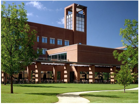
Figure 5 - BlackRock headquarters in New York City.